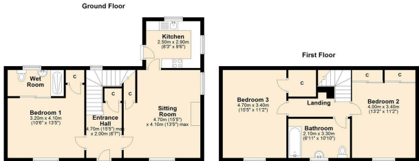
The Old Police Station, Brora